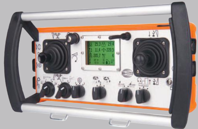
Version for construction cranes.