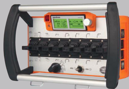
Version for hydraulic applications.