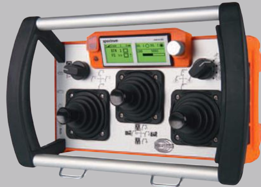
Version with 3 joysticks.

Cranes, machinery and the most diverse applications with a large function range.